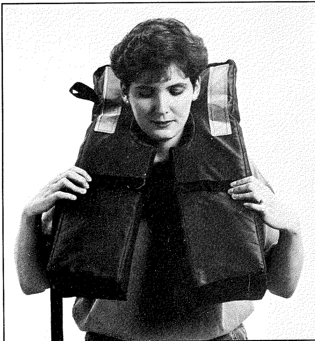
Separate front panels; slip over head.

Kent Sporting Goods Company, Inc. • New London, OH 44851