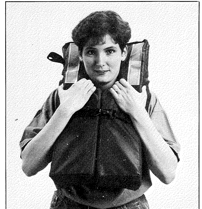
If necessary to jump overboard, hold onto preserver at front neck opening until in water.